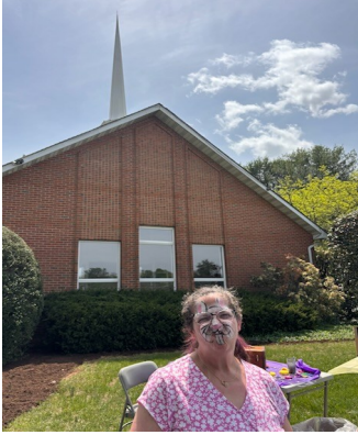
Outreach Team hosts Easter Egg hunt for the Community