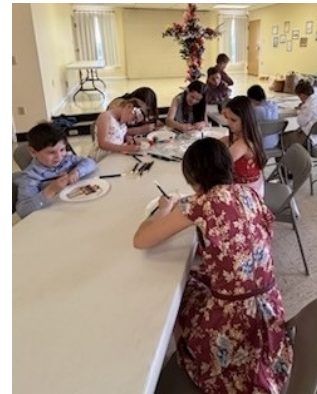
Easter Sunday School