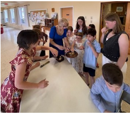
Our children take communion