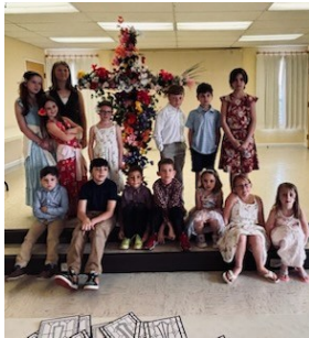
Our children decorate the Easter Cross